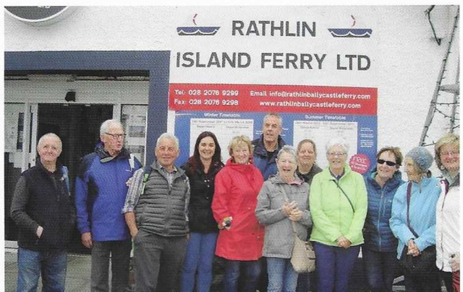
Members of the Magheramason Walking Club, in Ballycastle, waiting to board the ferry for Rathlin Island.

The Foyle branch of Gideons International will hold their Friendship and Praise evening in Magheramason Church Hall on Friday 7 September 2018 at