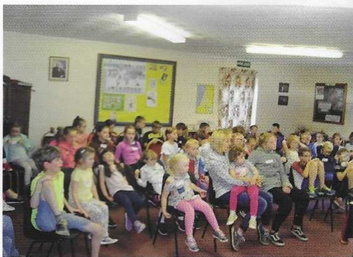
Children listening to the story of Daniel at the Holiday Bible club.